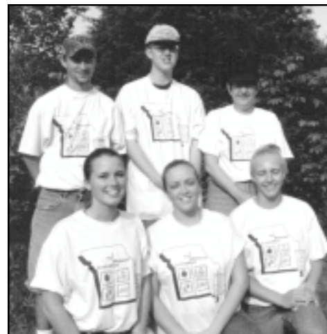
Top to bottom: 1st: Norborne High School 2nd: Lincoln High School 3rd: McCluer North High School