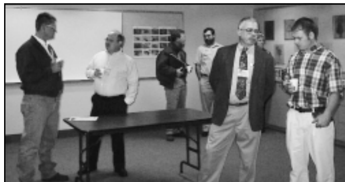
Fall Forum guests enjoy the refreshments provided by the Missouri Farm Bureau.